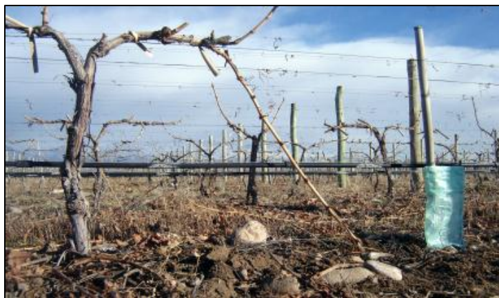
Grape layering at The Vines of Mendoza | Private Vineyard Estates

The new plant will never lose its connection with the mother vine. This “connection” assures the new vine is protected against nematodes and phylloxera provided by the rootstock in the mother plant.